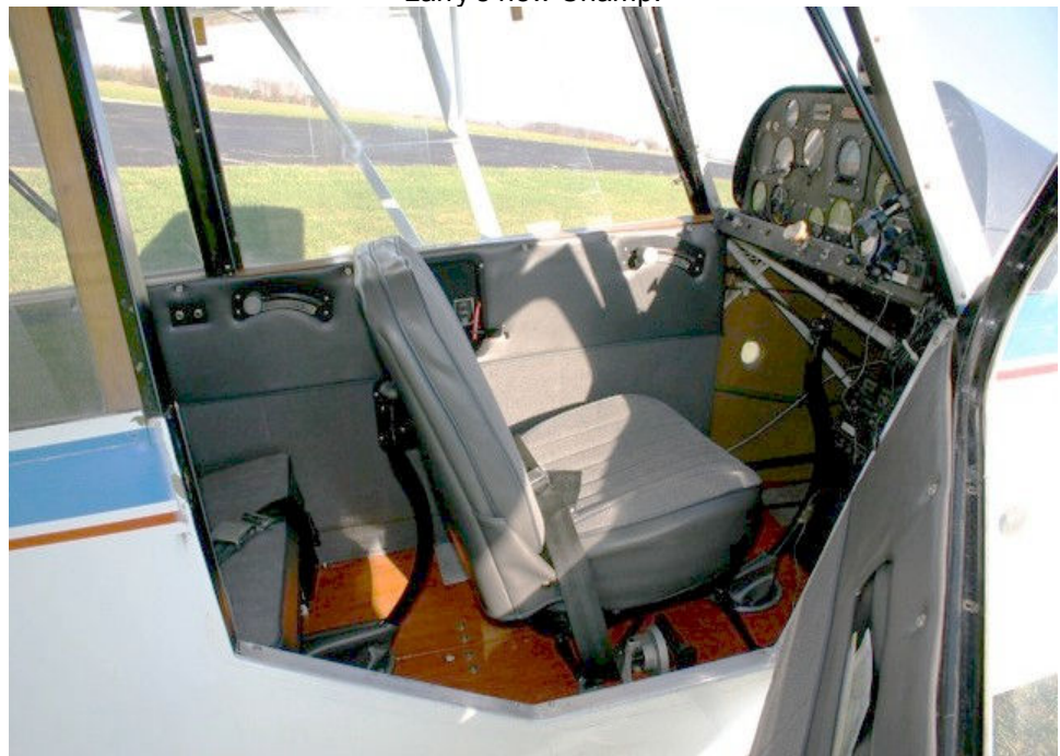
It's a 1961 Champion model 7EC modified with a 115 hp Lycoming O-235