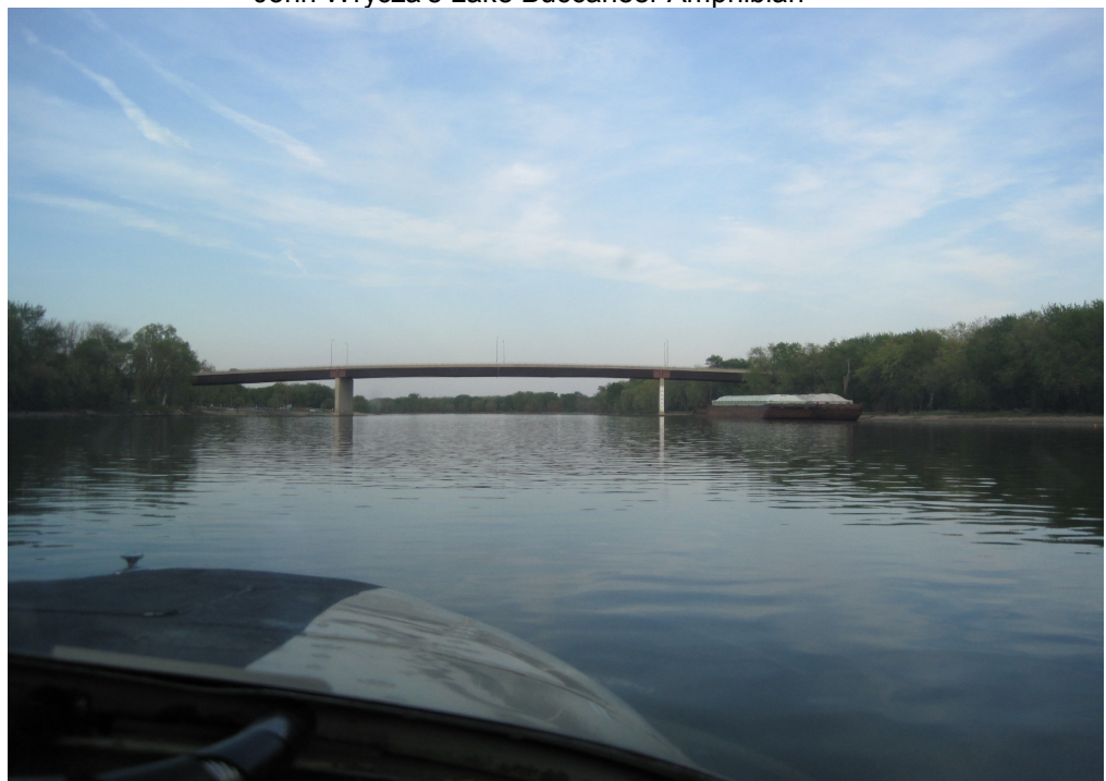
Illinois River bridge