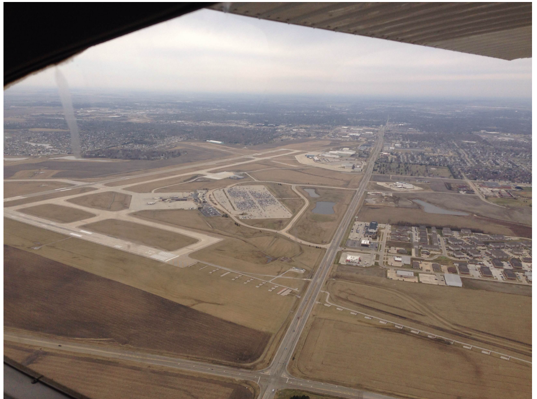
Bloomington Normal KBMI