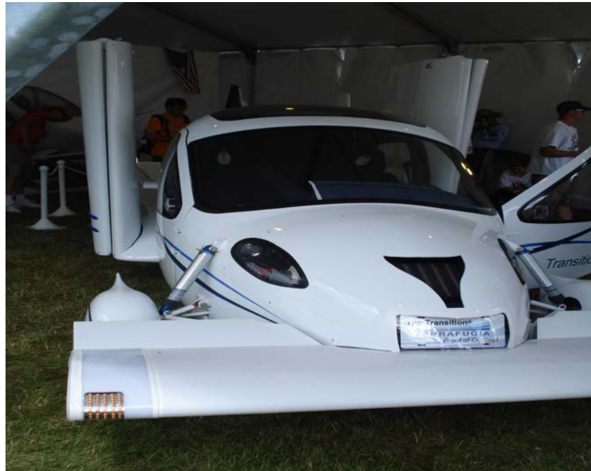
The Future and the Past come together at Oshkosh.

NEXT MEETING: WORK MEETING Tues, September 2, 5:00 PM